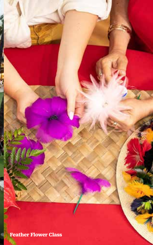
Feather Flower Class